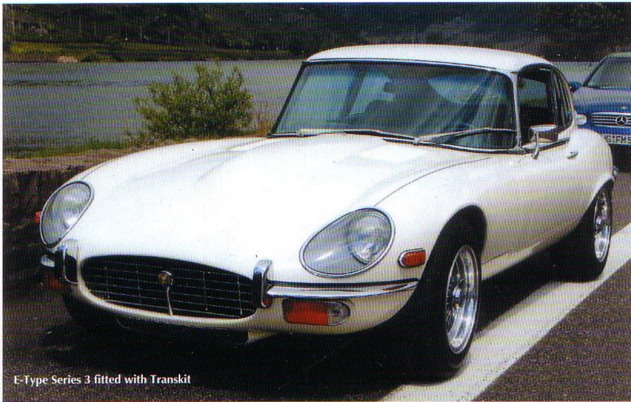
E-Type Series 3 fitted with Transkit